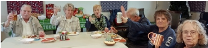
Super Bowl Party

Our Superbowl party was great fun with lots of prizes for attendees. We made about $75 for the raffle. We had 12 to 14 attendees and what a great Seahawks win!