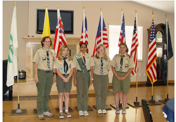
Scout Troop 777 with all the historical flags