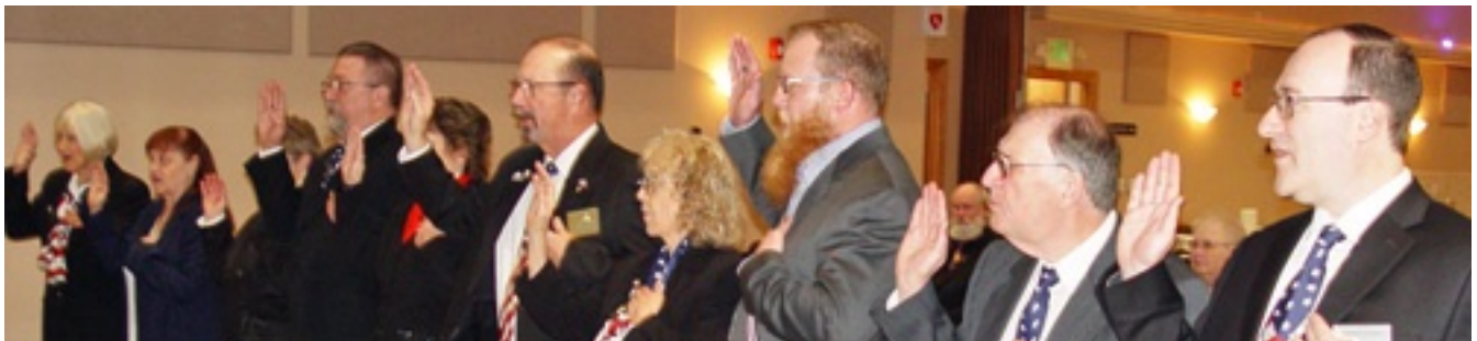
Taking the Oath of Office